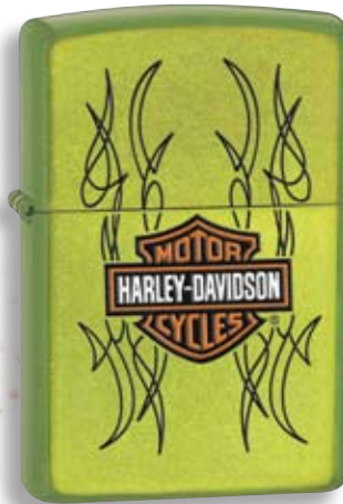
24774 NEW Lurid