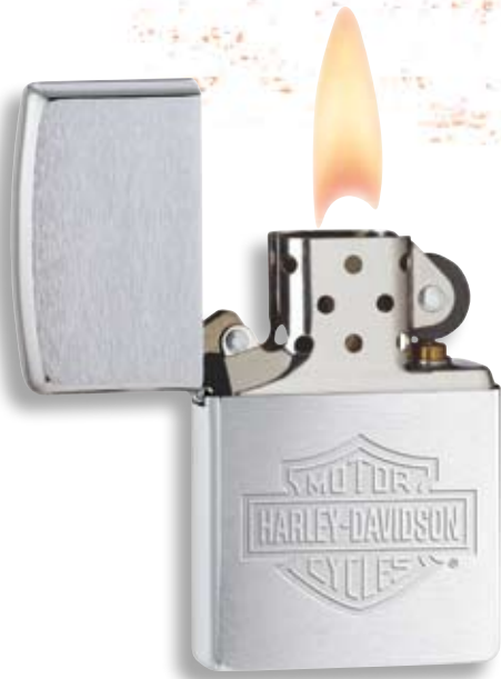
200HD.H199 Brushed Chrome