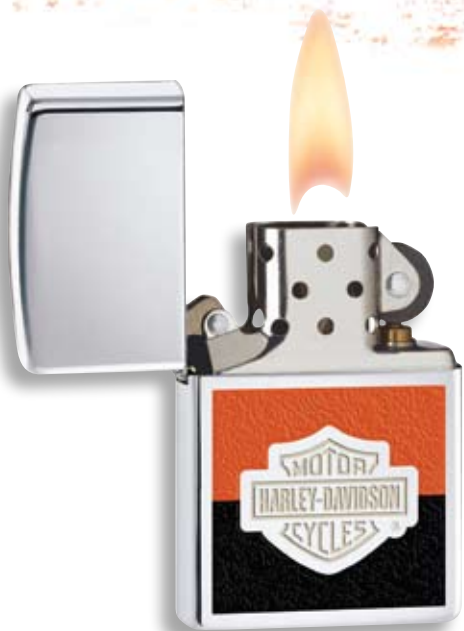
24507 High Polish Chrome