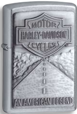
20229 Emblem Street Chrome