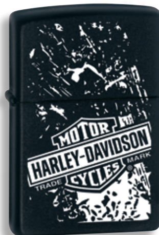
24768 NEW Black Matte