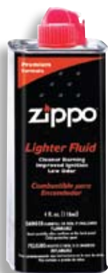
3141 Lighter Fluid 4 oz. (shipping carton of 24) (No.3341 carton of 12)

For optimum performance of every Zippo windproof pocket lighter, we recommend genuine Zippo flints, wicks, and premium lighter fluid.