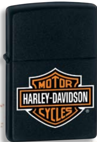
218HD.H252 Black Matte