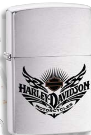
24293 Brushed Chrome