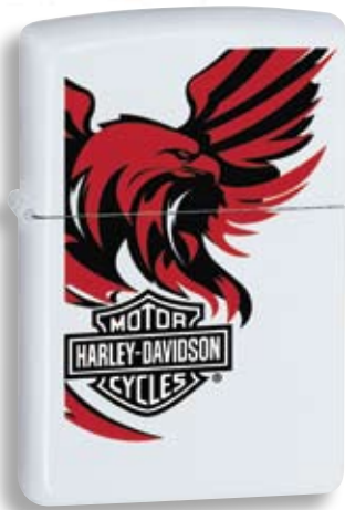
24769 NEW White Matte