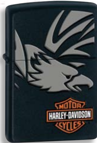
24773 NEW Black Matte