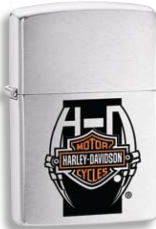
24505 Brushed Chrome