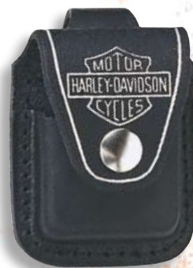
HDPBK H-D® Lighter Pouch w/Loop - Black.