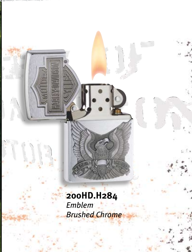
200HD.H284 Emblem Brushed Chrome