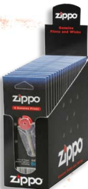
2406N Flint cards - 24 cards per display box; 24 boxes per master carton