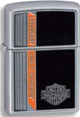
24665 NEW Satin Chrome