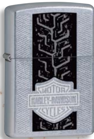
24671 NEW Street Chrome