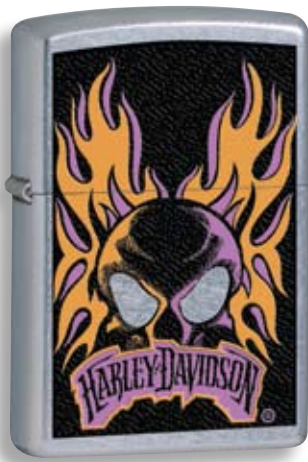
24506 Satin Chrome