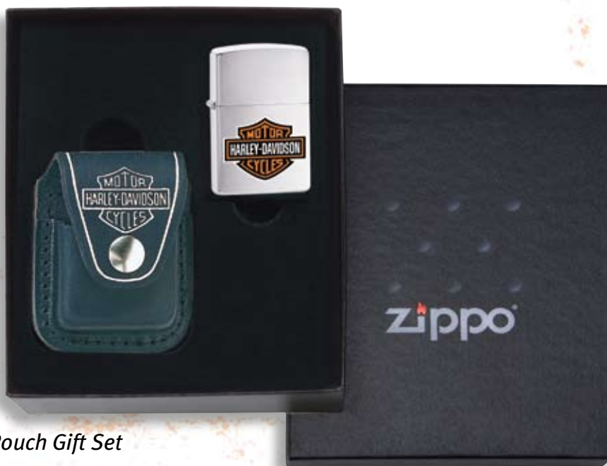
HDP6 H-D® Lighter Pouch Gift Set

Lighter Pouch Gift Set includes black leather pouch in a handsome gift box. Add any lighter to create a custom gift set. (Lighter not included.)