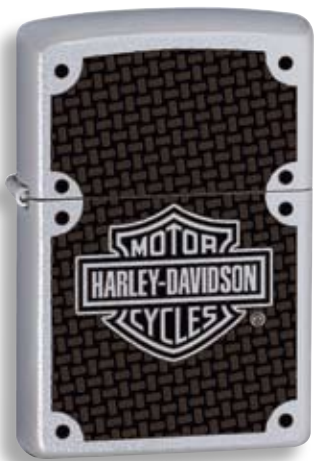
24025 Satin Chrome