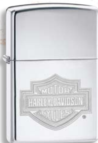
24776 NEW High Polish Chrome

Now Double Lustre brings a fresh look to this favorite traditional process. A simple image is etched, then selectively etched even deeper to produce multi-dimensional highlights. Buffed and plated to a gleaming patina, the Harley-Davidson Bar and Shield design displays bright and dark, high and low areas.