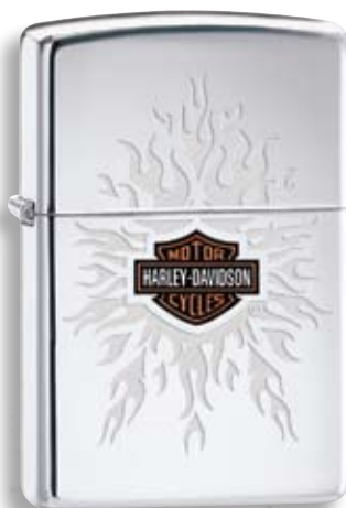
24504 High Polish Chrome