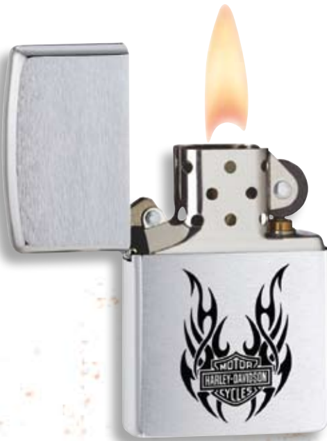
21046 Brushed Chrome