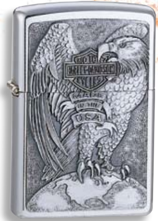
200HD.H231 Emblem Brushed Chrome