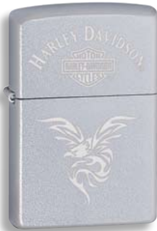
21047 Satin Chrome