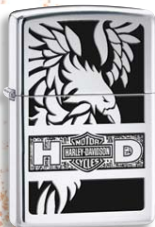
24775 NEW High Polish Chrome