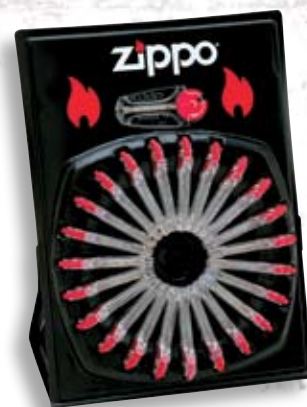
2406C Six Flint Dispenser - 24 per Display Card