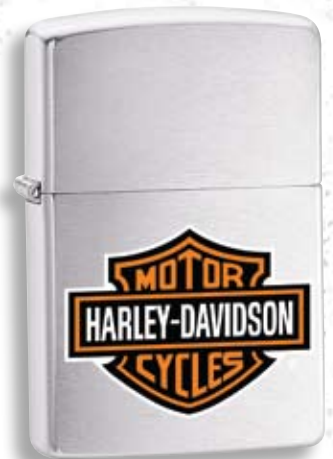
200HD.H252 Brushed Chrome