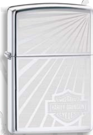
24292 High Polish Chrome