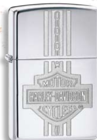
24677 NEW High Polish Chrome