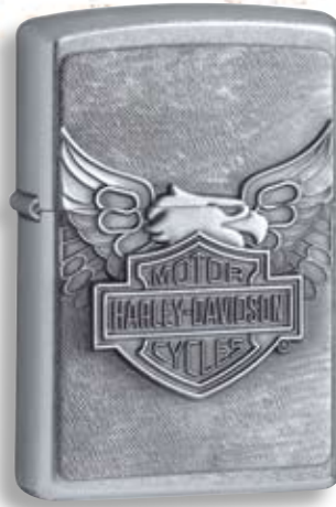
20230 Emblem Street Chrome