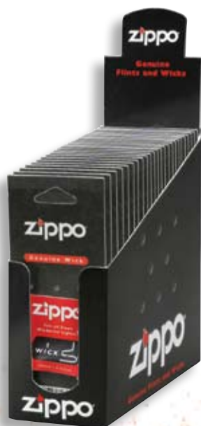
2425 Wick Cards - 24 cards per display box; 24 boxes per master carton