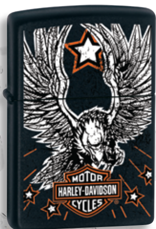
24772 NEW Black Matte