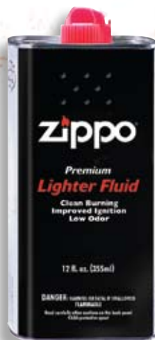
3165 Lighter Fluid 12 oz. (shipping carton of 24) (No.3365 carton of 12)