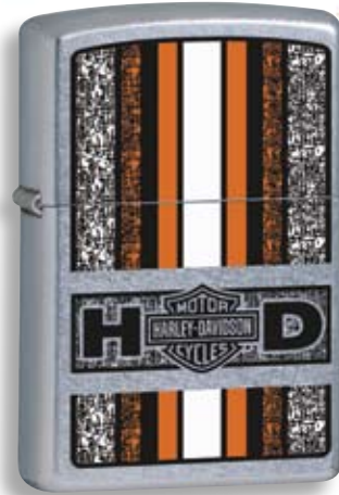
24767 NEW Street Chrome