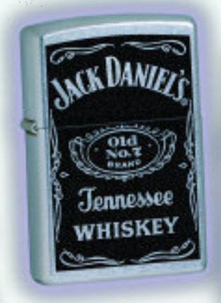
21043 Jack Daniels Label