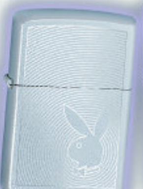
21031 Playboy Bunny Wave