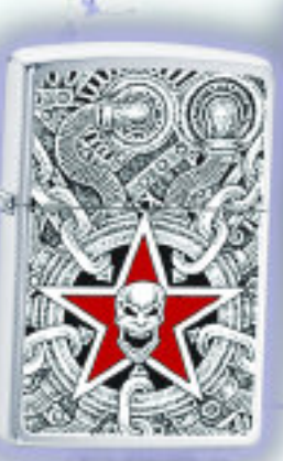
20412 Skull Industrial