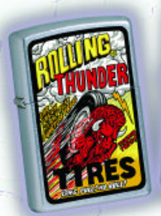
21013 Rolling Thunder