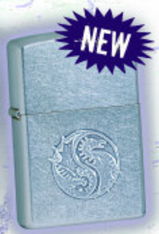
21035 Raised Dragon

Bold, bright, and bound to light up your sales! Turn Up the Heat II features 10 eyeball-popping designs with new manufacturing processes, and new licensed products!