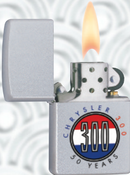
No. 20982 Chrysler 300 50 Years Satin Chrome Suggested Retail: $22.95