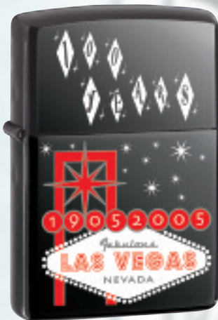
No. 20997 Las Vegas 100 Years Black Ice Suggested Retail: $29.95

Resplendent with lights, shows, glitz and glamour, Las Vegas is partying all year to commemorate its 100-year anniversary. The city's quintessential landmark, reproduced on two stunning PVD finish Zippo lighters, heralds the centennial celebration.