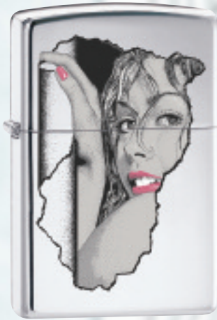
No. 20713 Seductive Stare High Polish Chrome Suggested Retail: $29.95