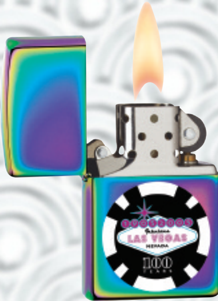
No. 20996 Las Vegas 100 - Ante Up Spectrum Suggested Retail: $27.95