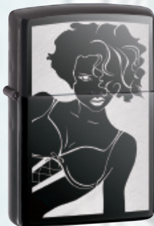
No. 20959 Tempting Tease Black Ice Suggested Retail: $29.95